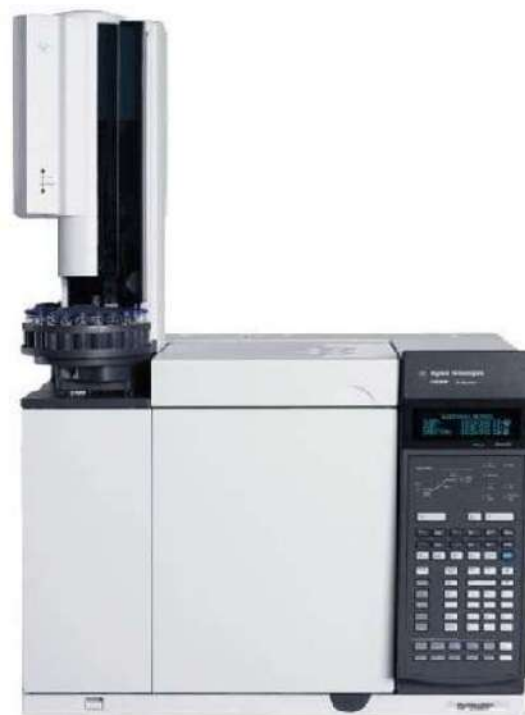
Agilent Technologies GC 7820A